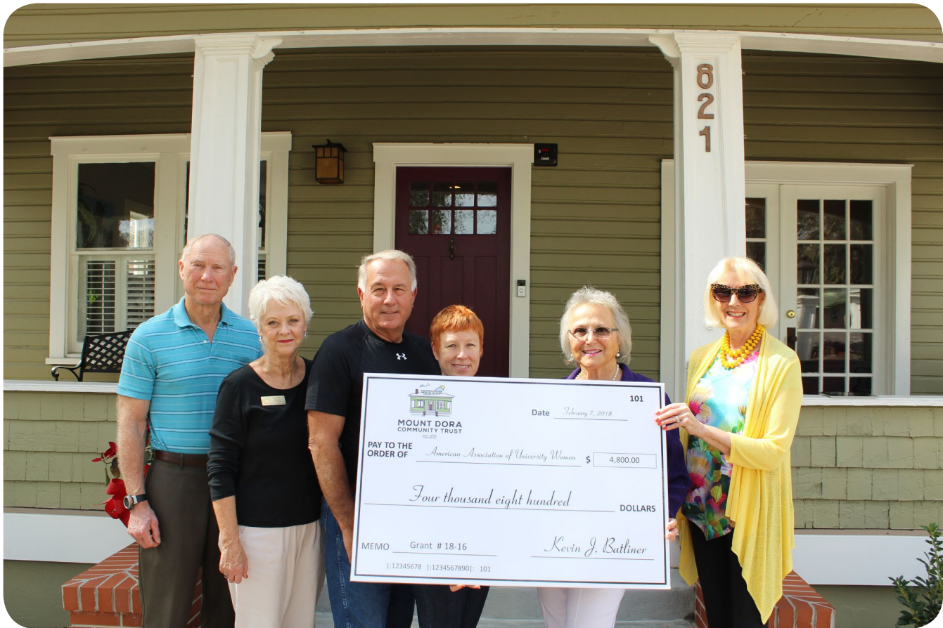
The MDCT Distribution Committee grants a $4,800 check to the American Association of University of Women for Tech Trek summer program and a college scholarship in the STEM field.