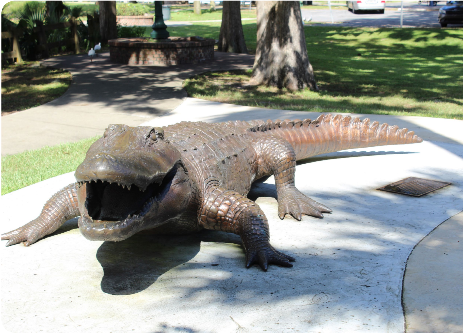
Bronze alligator near Lake Dora. Donated by generous citizens of Mount Dora through the Community Trust.